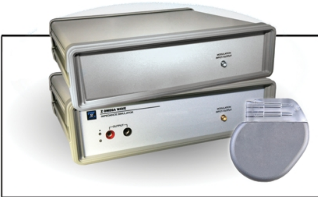
CONFIGURATION EXAMPLE: PULSE GENERATOR

Over 60% cost reduction Higher performance